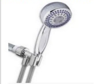
hand-held shower head