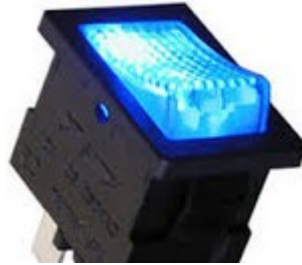
illuminated rocker switches